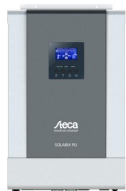
Steca Solarix PLI 5000-48